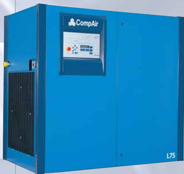
The CompAir L Series. A high capacity air compressor range that sets the highest standards in reliable, economic and efficient operation.