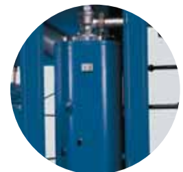
Large reclaimers with generously-sized fine separator elements, large oil coolers and aftercoolers