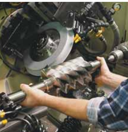
CompAir employs only the very best manufacturing techniques - your guarantee for reliability and performance