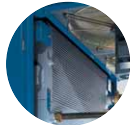
The large aftercooler effectively cools compressed air to as low as 5°C above ambient (dependent on model)