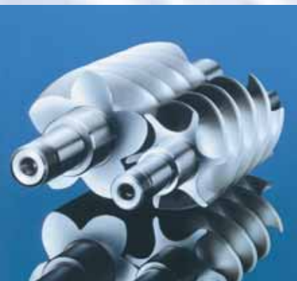
The CompAir screw profile - the result of continuous research and development