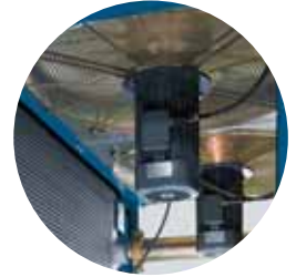
Plant cooling fan. The cool air passing through the unit picks up all radiant heat

As an option a heat recovery system can be incorporated into the oil circuit.