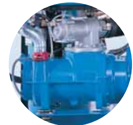
The high capacity compression element, with low rotor-tip speeds, gives high efficiency with maximum reliability